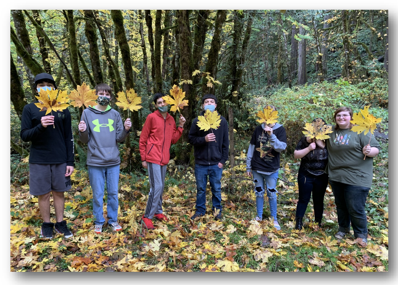
Natural Resources I class, out and about testing water quality and stopping to play for a bit in the big leaf maple pile.